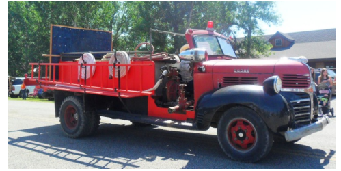
Huntley Project Class of 1964 in the 2014 Homesteader Parade.