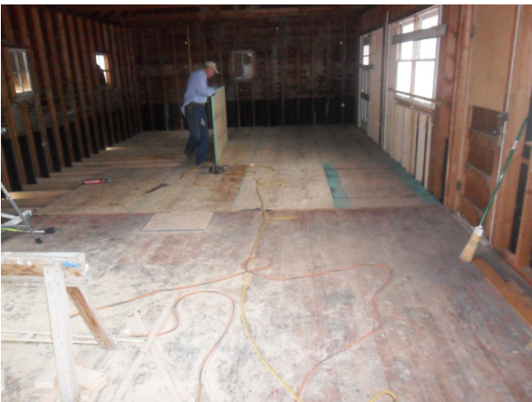
Dassinger Building Interior under construction.