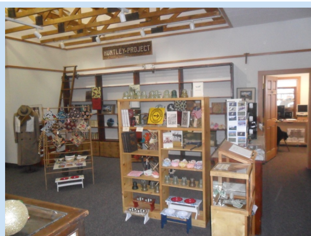
The Museum Gift Shop space at the entrance of the main Museum building.