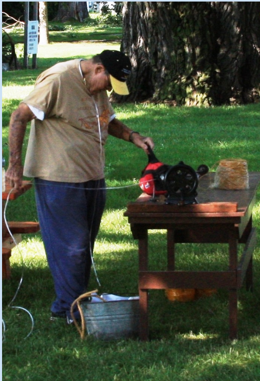
Shorty setting up the rope-making station during the 2014 Threshing Bee.