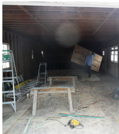
Dassinger Building Interior.